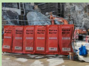
設置隔音屏障 Installation of Noise Barriers