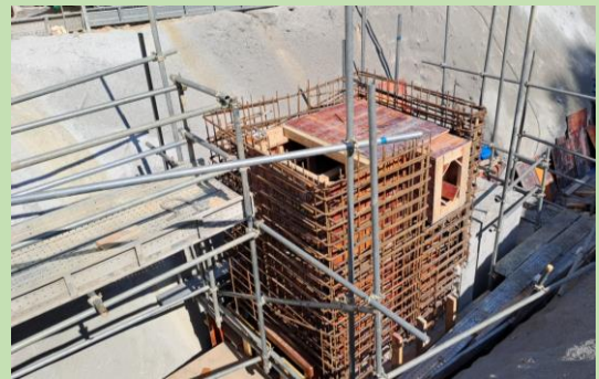
渠務工程 Drainage Construction Works