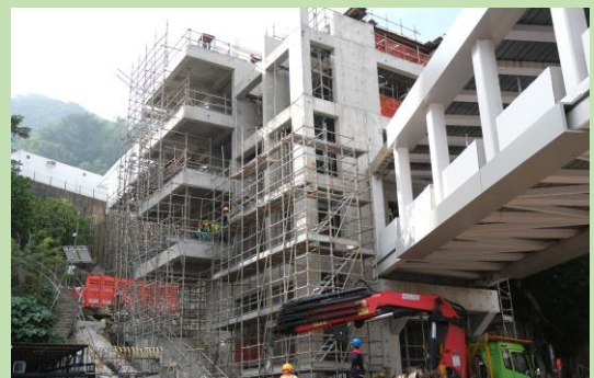
升降機塔工程 Lift Tower Construction