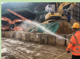
定時工地灑水 Regularly Water Spraying in Works Area