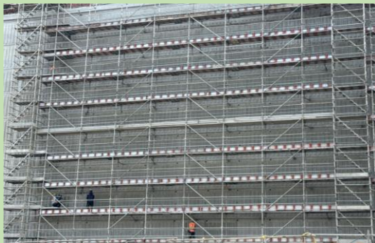
擋土牆混凝土結構工程 Concreting Works for Retaining Wall