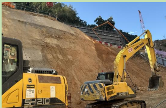
斜坡鞏固工程 Slope Stabilizing Works